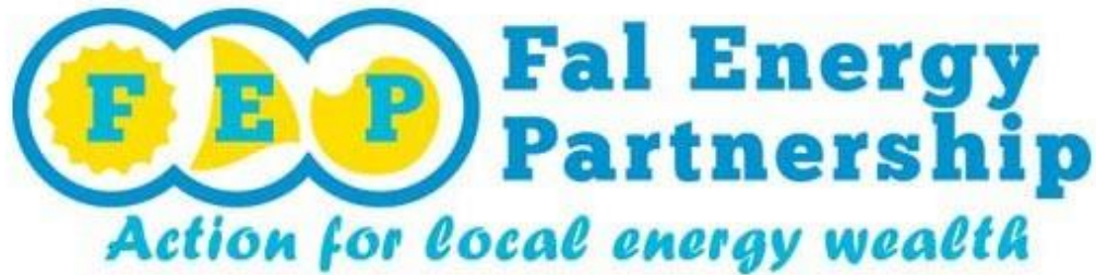
Figure 2 FEP logo and strap line